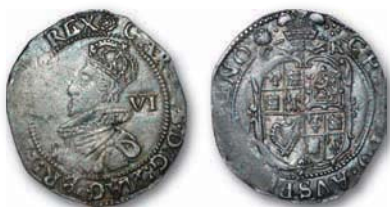
433 Charles I - Rose - Tower Sixpence. 2.96 grams. 1631-1632 AD. Group C. Rose mintmark. Obv: profile bust with VI behind. Rev: oval shield of arms with plume. S. 2810; N. 2239. Near very fine; scarce. £150 - £200