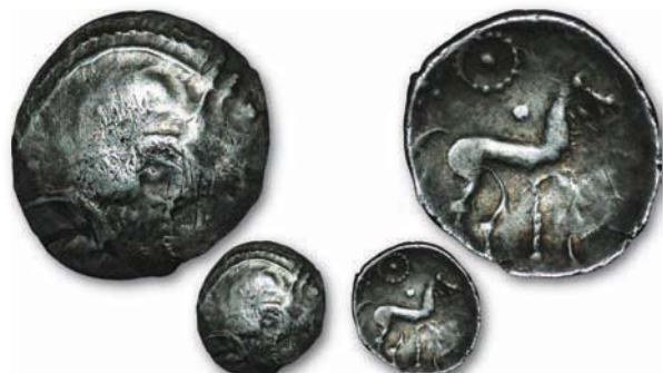
236 British Celtic - Iceni - Early Face/Horse Type - Silver Unit. 1.20 grams. Circa 50-30 BC. Obv: Celticized male head right with herringbone hair and large eye. Rev: horse right, wheel above, pole beneath. V. -; Allen type: EFH CC; BMC 3356-3555; S. 433 var. Very fine on a large flan. Celtic Coin Index Registration number: CCI 00.1801. £150 - £250