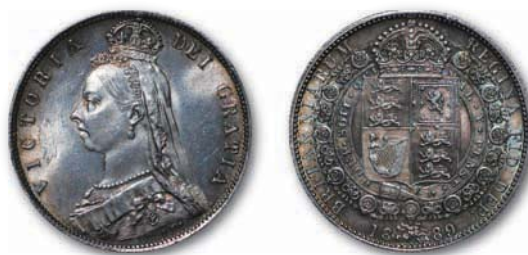
136 Victoria - 1889 - Halfcrown. 14.12 grams. Dated 1887. Jubilee head, dies ↑↓. Obv: with VICTORIA DEI GRATIA legend. Rev: crowned shield in garter with date 1887 below and BRITANNIARUM REGINA FID:DEF: legend. S. 3924; ESC 722. Almost uncirculated, light golden tone. £50 - £70