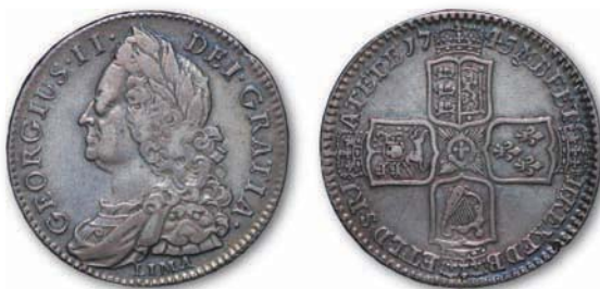
42 George II - 1745 - Lima Halfcrown. 14.87 grams. Dated 1745. Old bust with LIMA below for silver from Admiral Anson and privateers, dies ↑↓. Obv: with GEORGIUS.II.DEI.GRATIA legend. Rev: crowned cruciform shields with date 17-45 at English arms with M.B.F.ET.H. REX F D B ET L.D.S.R.I.A.T.ET.E. legend. Edge: with DECVS.ET.TVTAMEN.ANNO REGNI.DECIMO.NONO legend. S. 3695; ESC 605. Good very fine, lightly toned and pleasing. £150 - £250