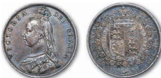
135 Victoria - 1887 - Halfcrown. 14.12 grams. Dated 1887. Jubilee head, dies ↑↓. Obv: with VICTORIA DEI GRATIA legend. Rev: crowned shield in garter with date 1887 below and BRITANNIARUM REGINA FID:DEF: legend. S. 3924; ESC 719. Almost uncirculated, deep blueish-grey full tone. £50 - £70