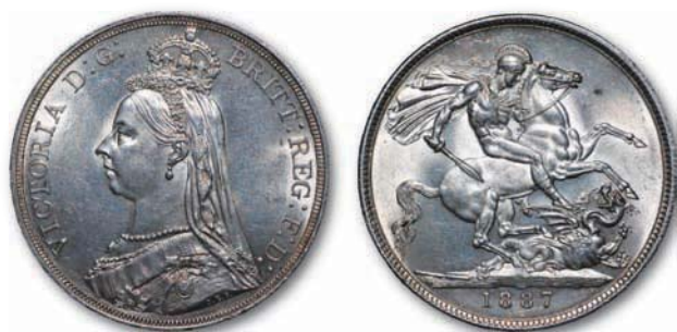
125 Victoria - 1887 - Crown. 28.21 grams. Dated 1887. Jubilee head, dies ↑↓. Obv: with VICTORIA D.G.BRITT.REG.F.D.legend. Rev: St George and dragon with date in exergue. S. 3921; ESC 296. About uncirculated, lightly toned; few tiny contact marks. £90 - £120