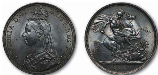
124 Victoria - 1887 - Crown. 28.27 grams. Dated 1887. Jubilee head, dies ↑↓. Obv: with VICTORIA D.G.BRITT.REG.F.D.legend. Rev: St George and dragon with date in exergue. S. 3921; ESC 296. Uncirculated, lightly toned; few tiny contact marks. £90 - £120