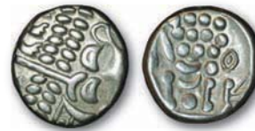
217 British Celtic - Durotriges - Silver Stater. 5.27 grams. Circa 1st century BC. Derived from Westerham type staters. Obv: wreath motif. Rev: disjointed horse left, large pellets. S. 366; V. 1235-1; M. 317; BMC 2525-2636. Extremely fine, struck in bright good quality silver. A superb example. Ex Brightstone, Isle of Wight hoard, 2005. £90 - £140