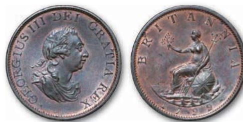
67 George III - 1799 - Halfpenny. 12.82 grams. Dated 1799. Laureate bust, dies ↑↓. Obv: with GEORGIUS III DEI GRATIA REX legend. Rev: Britannia seated with SOHO in waves, ship with 6 gunports in relief, date 1799 below and BRITANNIA legend. S. 3778; Peck 1249. About uncirculated, some lustre with small die crack on cheek. £100 - £200