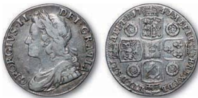
43 George II - 1741 - Roses Shilling. 5.91 grams. Dated 1741. Young bust, dies ↑↓. Obv: with GEORGIVS.II.DEI.GRATIA. legend. Rev: crowned cruciform shields with roses in angles, date 17-41 at English arms and .M.B.F.ET. H. REX.F.D. B.ET.L.D.S.R.I.A.T. ET.E. legend. S. 3701; ESC 1202. Very fine. £90 - £120