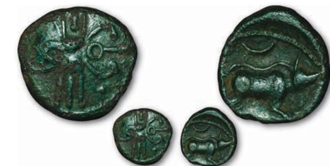
214 British Celtic - Trinovantes - Boar and Crescent - AE Unit. 2.81 grams. Late 1st century BC. Obv: cross and crescents. Rev: boar right, crescent above. V. 1713.01; Allen type: TASC; M. 179; BMC 1702-05; S. 252. Good very fine. Celtic Coin Index Registration number: CCI 03.0214. £140 - £200