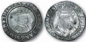
470 Ireland - James I - Bell - Sixpence. 2.07 grams. 1603-1604 AD. First Coinage. Bell mintmark. Obv: profile bust. Rev: crowned harp. S. 6514. Near very fine. £40 - £60