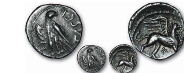
215 British Celtic - Tasciovanus - Griffin - Silver Unit. 1.36 grams. Late 1st century BC - early 1st century AD. Obv: eagle standing left, TASC to right, O to left. Rev: griffin standing right with wings outstretched. V. 160; BMC 1658-59; S. 232. Good very fine. £200 - £300