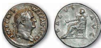
292 Roman Empire - Vespasian - Salus Denarius. 3.14 grams. Rome. 73 AD. Obv: IMP CAES VESP AVG CEN, laureate head right. Rev: SALVS AVG, Salus seated left, holding patera. RIC II 513; RSC 431; Sear - . Almost extremely fine. £50 - £80