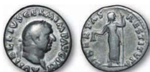
291 Roman Empire - Vitellius - Libertas Denarius. 3.21 grams. Rome. 69 AD. Obv: A VITELLIVS GERM IMP AVG TR P, laureate head right. Rev: LIBERTAS RESTITVTA, Libertas standing facing, head right, holding pileus and sceptre. RIC 105; Cohen 31; RSC 47; cf Sear 2198 (different obverse legend). Good fine. £200 - £250