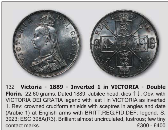
132 Victoria - 1889 - Inverted 1 in VICTORIA - Double Florin. 22.60 grams. Dated 1889. Jubilee head, dies ↑↓. Obv: with VICTORIA DEI GRATIA legend with last I in VICTORIA as inverted 1. Rev: crowned cruciform shields with sceptres in angles and date (Arabic 1) at English arms with BRITT:REG:FID:DEF: legend. S. 3923; ESC 398A(R3). Brilliant almost uncirculated, lustrous; few tiny contact marks. £300 - £400

(Arabic 1) at English arms with BRITT:REG:FID:DEF: legend. S. 3923; ESC 397. Uncirculated, full reddish tone, lustrous; few tiny contact marks. £90 - £120