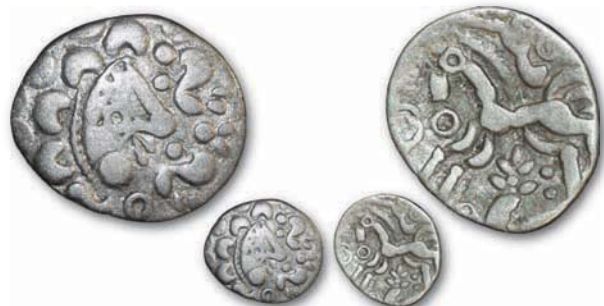
219 British Celtic - Dobunni - Silver Unit. 0.88 grams. Circa 1st century BC. Large flan. Obv: head right. Rev: triple-tailed horse left with symbols around. S. 377; BMC 2950 etc. Very fine. £60 - £90