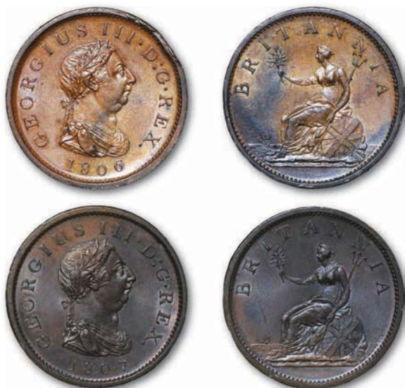
66 George III - 1806, 1807 - Pennies (2). 18.82, 18.92 grams. Dated 1806 and 1807. Laureate bust with date below, dies ↑↓. Obv: with GEORGIUS III.D.G.REX. legends. Rev: Britannia seated with SOHO in waves and BRITANNIA legends. The 1806 with two berries in laurel branch (compare with 1807 coin) and incuse hair curl. S. 3780; Peck 1342/1344. Near uncirculated, toned; the 1806 with obverse edge knock. £100 - £200