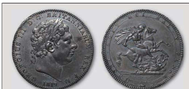
69 George III - 1819 (LIX) - Crown. 28.05 grams. Dated 1819. Bust with date below, dies ↑↓. Obv: with GEORGIUS III D G BRITANNIARUM REX F D legend. Rev: St George and dragon within garter. Edge: DECUS ET TUTAMEN ANNO REGNI LIX* legend. S. 3787; ESC 215. About uncirculated, lustrous with small edge knock to obverse and slight weakness to reverse; lightly toned and pleasing. £300 - £400