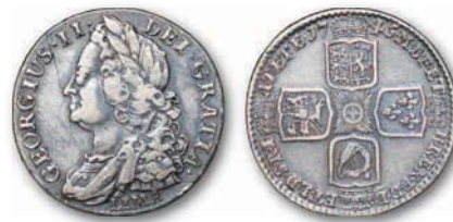
45 George II - 1745 - Lima Shilling. 5.96 grams. Dated 1745. Old bust with LIMA below for silver from Admiral Anson and privateers, dies ↑↓. Obv: with GEORGIVS.II.DEI.GRATIA. legend. Rev: crowned cruciform shields with date 17-45 at English arms and .M.B.F.ET.H. REX.F.D.B.ET. L.D.S.R.I.A.T.ET.E. legend. S. 3703; ESC 1205. Good very fine and toned. £200 - £300