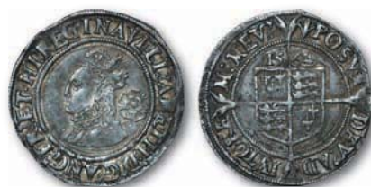
412 Elizabeth I - 1564 - Third/Fourth Issue Sixpence. 3.07 grams. Dated 1564 AD. Third/Fourth Issue, smaller flan. Pheon mintmark. Obv: profile bust with rose behind. Rev: long cross over arms with date above. S. 2561; N. 1997. Very fine, excellent bust; scarce thus. £120 - £200