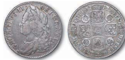
44 George II - 1747 - Roses Shilling. 5.93 grams. Dated 1747. Old bust, dies ↑↓. Obv: with GEORGIVS.II.DEI.GRATIA. legend. Rev: crowned cruciform shields with roses in angles, date 17-47 at English arms and .M.B.F.ET.H. REX.F.D.B.ET. L.D.S.R.I.A.T. ET.E. legend. S. 3702; ESC 1209. Very fine. £70 - £100