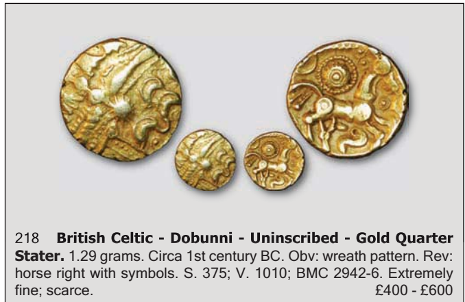
218 British Celtic - Dobunni - Uninscribed - Gold Quarter Stater. 1.29 grams. Circa 1st century BC. Obv: wreath pattern. Rev: horse right with symbols. S. 375; V. 1010; BMC 2942-6. Extremely fine; scarce. £400 - £600