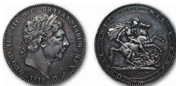
68 George III - 1818 (LVIII) - Crown. 28.23 grams. Dated 1818. Bust with date below, dies ↑↓. Obv: with GEORGIUS III D G BRITANNIARUM REX F D legend. Rev: St George and dragon within garter. Edge: DECUS ET TUTAMEN ANNO REGNI LVIII* legend. S. 3787; ESC 211. Near extremely fine, reverse a little weak and with some minor abrasions; toned. £120 - £200