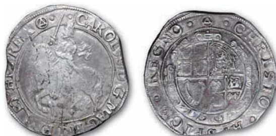
441 Charles I - Group IV - Triangle-in-Circle - Tower Halfcrown. 14.26 grams. 1641-1643; Group IV; Type 4. Triangle-in-circle mintmark. S. 2779; N. 2214. Good fine, reverse better. £70 - £90