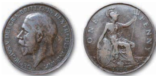
167 George V - 1926ME - Modified Effigy Penny. 9.15 grams. Dated 1926. Modified effigy, Dies ↑ ↓. Obv: with GEORGIUS V DEI GRA:BRITT:OMN:REX:FID:DEF:IND:IMP legend. Rev: Britannia seated with date 1926 in exergue and ONE PENNY legend. S. 4054. Good fine, toned; rare. £50 - £70