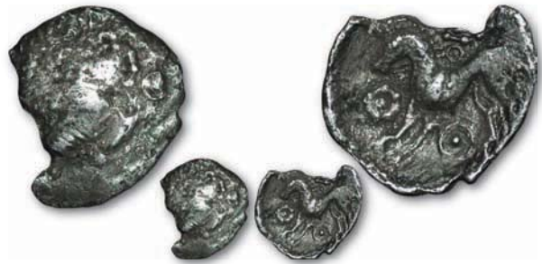
233 British Celtic - Iceni - Bury D - Silver Unit. 0.94 grams. Circa 50-40 BC. Obv: bearded head left on small neck (largely worn here). Rev: horse left, front legs outstretched, pellet in ring below chest, ring of pellets around pellet below head, large ring of pellets above. Icenian early face/horse type, see also 00.1917 etc. Allen type: EFH. Chipped, fine. Extremely rare. Celtic Coin Index Registration number: CCI: 98.2308. £90 - £120

Probably pellet-and-ring design above horse.