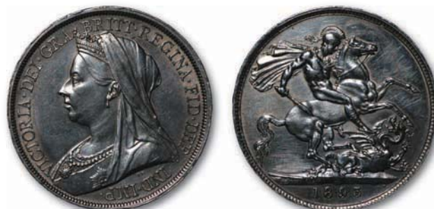
139 Victoria - 1893 (LVI) - Crown. 28.16 grams. Dated 1893. Old head, dies ↑↓. Obv: with VICTORIA DEI GRA BRITT. REGINA FID: DEF: IND. IMP. legend. Rev: St George and dragon with date 1893 in exergue. Edge: DECUS ET TUTAMEN* ANNO REGNI LVI* raised legend. S. 3937; ESC 303. Brilliant, almost uncirculated. £200 - £300