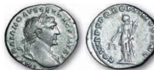
295 Roman Empire - Trajan - Aequitas Denarius. 2.78 grams. Rome. 103-111 AD. Obv: IMP TRAIANO AVG GER DAC P M TR P, laureate bust right, draped left shoulder. Rev: COS V PP SPQR OPTIMO PRINC, Aequitas standing left, holding scales and cornucopia. RIC II 118 (described as an aureus in error); RSC 85; BMC 281; Sear - . Near extremely fine. £40 - £70