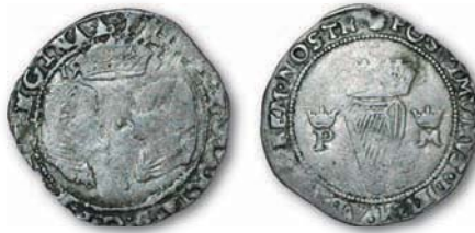
468 Ireland - Mary and Philip - Groat. 3.05 grams. Dated 1557 AD. Base silver issue. Rose mintmark. Obv: crown mintmark. Rev: crowned harp dividing date. S. 6501B. Fine and better for issue. £30 - £50