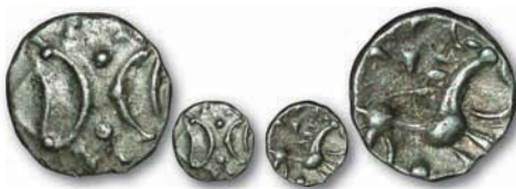
230 British Celtic - Iceni - Silver Half Unit. 0.42 grams. Mid - late 1st century BC. Obv: back-to-back crescents at middle of wreath. Rev: horse right. V. 683.01; Allen type: EPH. Very fine and better. Celtic Coin Index Registration number: CCI 98.2288. Found Cambridgeshire 1998. £40 - £60