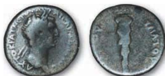
293 Roman Empire - Nerva - Capadoceia - AR Didrachm. 6.66 grams. Caesarea, Cappadocia. 97 AD. Obv: AVTOKPAT NEPOYAC KAICAP CEBACTOC, laureate head right. Rev: UPATOU TRITOU, club. Sydenham 146; Metcalf 33; SGI 947. See also wildwinds.com (this coin). Fine. £30 - £50