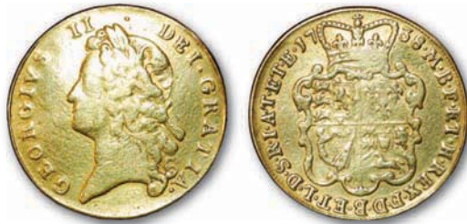
41 George II - 1738 - Gold Two Guineas. 16.32 grams. Dated 1738 AD. dies ↑↓. Obv: profile bust with GEORGIVS.II.DEI.GRATIA legend. Rev: crowned arms dividing date with M B F ET H REX F D B ET L D S R I A T ET E legend. S. 3667B. Fine; edge smoothed (ex mount?). £450 - £550