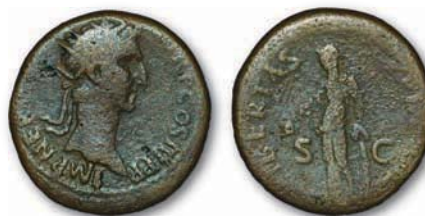
294 Roman Empire - Nerva - AE Dupondius. 13.24 grams. Rome. 97 AD. Obv: IMP NERVA CAES AVG P M TR P COS III P P, radiate head right. Rev: LIBERTAS PVBLICA S-C, Liberty standing left, holding pileus and sceptre. RIC II 87; Cohen 116; 3059. See also wildwinds.com (this coin). Fine. £10 - £20