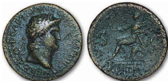
290 Roman Empire - Nero - Sestertius. 27.41 grams. Lyons. 65 AD. Obv: NERO CLAVD CAESAR AVG GER P M TR P IMP P P, laureate head right, with small globe (early type of globe) at point of bust. Rev: S-C, Roma seated left on cuirass, holding Victory and parazonium; behind her, two shields. In exergue, ROMA. RIC I 398; WCN 409; cf Sear 1961 (bust type). Fine, with good bust. £90 - £120