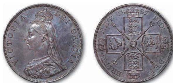
129 Victoria - 1887 (Arabic) - Double Florin. 22.50 grams. Dated 1887. Jubilee head, dies ↑↓. Obv: with VICTORIA DEI GRATIA legend. Rev: crowned cruciform shields with sceptres in angles and date (Arabic 1) at English arms with BRITT: REG: FID: DEF: legend. S. 3923; ESC 395. Uncirculated, fields almost proof-like, full purple-grey tone; few tiny contact marks. £70 - £90