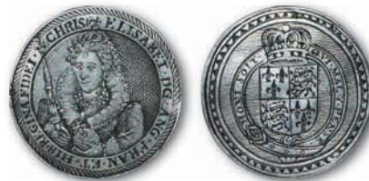
474 Van der Passe - Elizabeth I - Silver Card Counter. 2.51 grams. Circa 1630-1635 AD. From the Sovereigns of England Series; school of Van der Passe. Obv: half length figure of Elizabeth I. Rev: Royal arms. Mitchiner, p. 1675. Very fine; scarce. £120 - £200