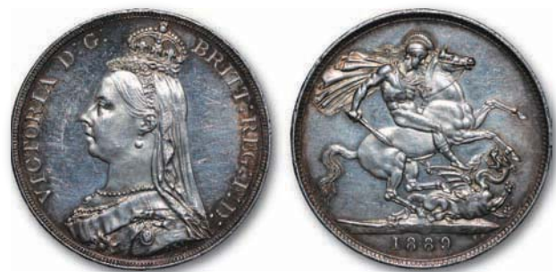
127 Victoria - 1889 - Crown. 28.17 grams. Dated 1889. Jubilee head, dies ↑↓. Obv: with VICTORIA D.G.BRITT.REG.F.D.legend. Rev: St George and dragon with date in exergue. S. 3921; ESC 299. About uncirculated, light toned, proof-like fields. £120 - £200