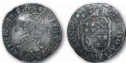
434 Charles I - Rose - Tower Sixpence. 2.83 grams. 1631-1632 AD. Group C. Rose mintmark. Obv: profile bust with VI behind. Rev: oval shield of arms with plume. S. 2810; N. 2239. Good fine; scarce. £100 - £150