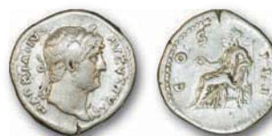
296 Roman Empire - Hadrian - Concordia Denarius. 3.35 grams. Rome. 125-128 AD. Obv: HADRIANVS AVGVSTVS, laureate head right, slight drapery on left shoulder. Rev: COS III, Concordia seated left on throne, holding patera and resting left arm on statuette of Spes on column at side of throne. RIC III 172; RSC 328a; BMC 394; Sear 3475. Good very fine. £50 - £80