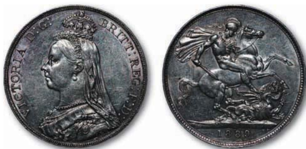
126 Victoria - 1889 - Crown. 28.25 grams. Dated 1889. Jubilee head, dies ↑↓. Obv: with VICTORIA D.G.BRITT.REG.F.D.legend. Rev: St George and dragon with date in exergue. S. 3921; ESC 299. Almost uncirculated, very lightly toned; tiny contact marks and hairlines. £120 - £200