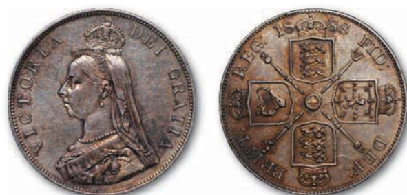
131 Victoria - 1888 - Double Florin. 22.58 grams. Dated 1888. Jubilee head, dies ↑↓. Obv: with VICTORIA DEI GRATIA legend. Rev: crowned cruciform shields with sceptres in angles and date