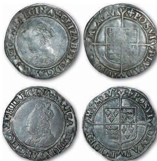
408 Elizabeth I - Cross Crosslet - Second Issue Shillings (2). 6.34, 5.77 grams. 1560-1561 AD. Second Issue. Cross crosslet mintmark. Obv: profile bust. Rev: long cross over arms. S. 2555; N. 1985. Fine and good fine. One ex CNG 150, lot 305. £200 - £300