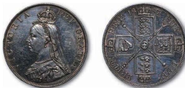
128 Victoria - 1887 (Arabic) - Double Florin. 22.55 grams. Dated 1887. Jubilee head, dies ↑↓. Obv: with VICTORIA DEI GRATIA legend. Rev: crowned cruciform shields with sceptres in angles and date (Arabic 1) at English arms with BRITT: REG: FID: DEF: legend. S. 3923; ESC 395. Brilliant uncirculated, fields proof-like, very lightly toned; tiny contact marks/hairlines. £70 - £90