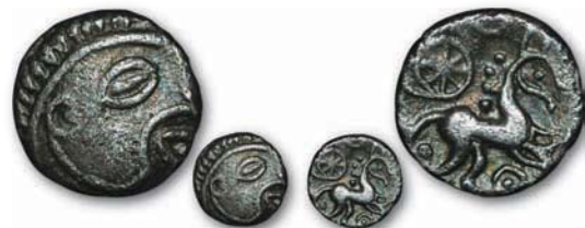
234 British Celtic - Iceni - Early Face/Horse Type - Silver Unit. 0.95 grams. Circa 50-30 BC. Obv: Celticized male head right with herringbone hair and large eye. Rev: horse right, wheel above. V. 665.03; Allen type: EFH CB; BMC 3356-3555; S. 433 var. Very fine. Celtic Coin Index Registration number: CCI: 98.2298. £150 - £200