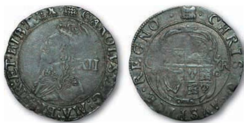
431 Charles I - Portcullis - Tower Shilling. 5.98 grams. 1633-1634 AD. Group D. Portcullis mintmark. Obv: profile bust with XII behind. Rev: oval shield of arms dividing CR. S. 2789; N. 2223. Very fine; toned. £150 - £200