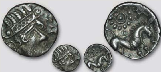
231 British Celtic - Iceni - Bury Type B - Silver Unit. 1.39 grams. Circa 50-40 BC. Obv: Celticized female head right with corded hair, wearing a diadem. Rev: horse right. V. -; Allen type: Bury B; BMC 3524-35; S. 432 var. Good very fine. Celtic Coin Index Registration number: CCI 00.1800. Found Norfolk 2000. £200 - £300