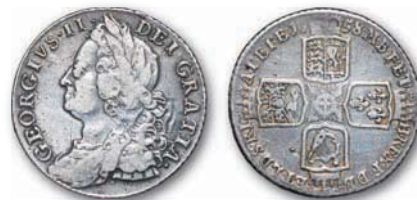
46 George II - 1758 - Shilling. 5.96 grams. Dated 1758. Old bust, dies ↑↓. Obv: with GEORGIVS.II.DEI.GRATIA. legend. Rev: crowned cruciform shields with date 17-58 at English arms and .M.B.F.ET.H. REX.F.D.B.ET. L.D.S.R.I.A.T.ET.E. legend. S. 3704; ESC 1213. Good very fine. £60 - £90