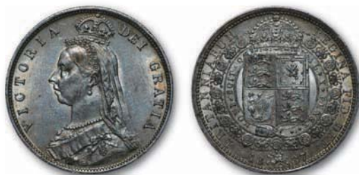
134 Victoria - 1887 - Halfcrown. 14.13 grams. Dated 1887. Jubilee head, dies ↑↓. Obv: with VICTORIA DEI GRATIA legend. Rev: crowned shield in garter with date 1887 below and BRITANNIARUM REGINA FID:DEF: legend. S. 3924; ESC 719. Almost uncirculated, lustrous, very lightly toned. £50 - £70