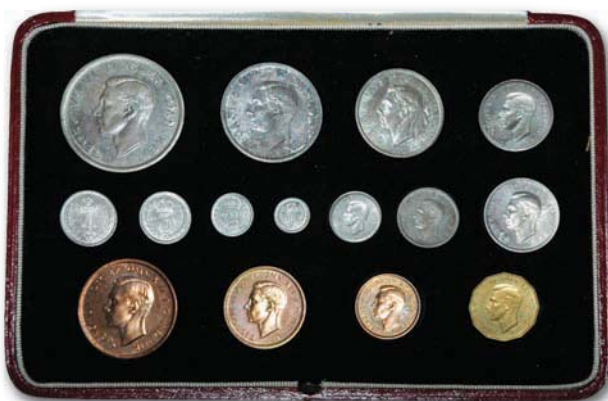
168 George VI - 1937 - Cased Coronation Proof Set (15). Dated 1937. Comprising fifteen coins: crown, halfcrown, florin, shillings(2), sixpence, threepences(2), Maundy set, penny, halfpenny and farthing. S. PS16. About FDC, tiny hairlines/marks on some, lightly toned, in leatherette case. £200 - £300