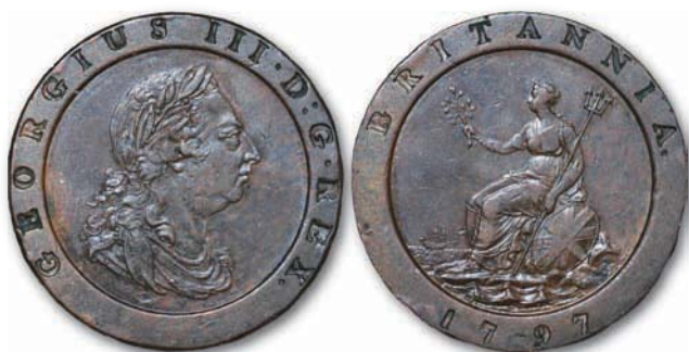
64 George III - 1797 - Cartwheel Twopence. 58.18 grams. Dated 1797. Laureate bust with K. on drapery, dies ↑↓. Obv: with incuse GEORGIUS III.D.G.REX. legend. Rev: Britannia seated with SOHO in waves, incuse date 1797 below and incuse BRITANNIA legend. S. 3776; Peck 1077. Near extremely fine with some minor knocks and abrasions; toned. £120 - £200