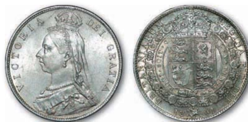
137 Victoria - 1891 - Halfcrown. 14.11 grams. Dated 1891 AD. Jubilee head. Obv: profile bust with VICTORIA DEI GRATIA legend. Rev: crowned shield in garter with date and BRITANNIARUM REGINA FID DEF legend. S. 3924; ESC724. Almost uncirculated. £120 - £180