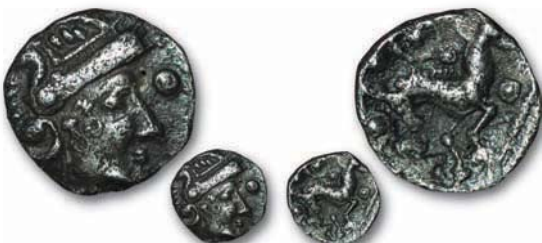
232 British Celtic - Iceni - Bury Head Type C - Silver Unit. 1.22 grams. Circa 50-40 BC. Obv: Celticized female head right, wearing a diadem. Rev: horse right. V. -; Allen type: Bury C; BMC 3524-35; S.432 var. Very fine. Celtic Coin Index Registration number: CCI 92.0389. Found Norfolk 1992. £150 - £200