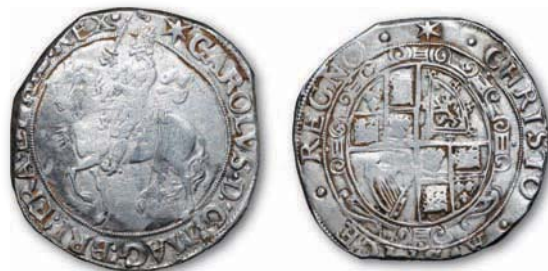
438 Charles I - Group III - Star - Tower Halfcrown. 15.20 grams. 1640-1641; Group III; Type 3a2. Bell mintmark. Scarf from shoulder. S. 2775; N. 2211. Good fine, reverse better. £70 - £90