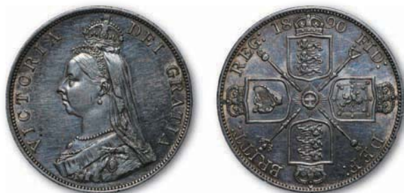
133 Victoria - 1890 - Double Florin. 22.57 grams. Dated 1890. Jubilee head, dies ↑↓. Obv: with VICTORIA DEI GRATIA legend. Rev: crowned cruciform shields with sceptres in angles and date (Arabic 1) at English arms with BRITT:REG:FID:DEF: legend. S. 3923; ESC 399. Brilliant good extremely fine, lustrous; few tiny contact marks. £90 - £120