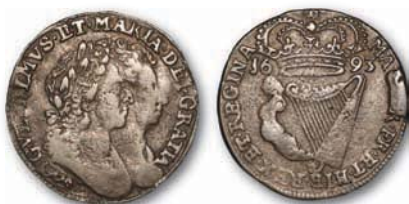
472 Ireland - William and Mary - 1693 - Halfpenny. 6.55 grams. Dated 1693 AD. Milled Edge. Obv: conjoined profile busts. Rev: crowned harp dividing date. S. 6597. About very fine, reverse better; scarce thus. £60 - £90