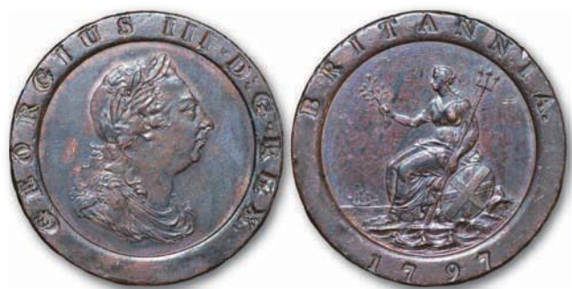
65 George III - 1797 - Mis-Strike - Cartwheel Twopence. 56.95 grams. Dated 1797. Laureate bust with K. on drapery, dies ↑↓. Obv: with incuse GEORGIUS III.D.G.REX. legend with letters doubled in striking. Rev: Britannia seated with SOHO in waves, incuse date 1797 below and incuse BRITANNIA legend. S. 3776; Peck 1077. Near extremely fine with minor scratch top obverse field; toned. The doubled obverse legend most interesting. £120 - £200