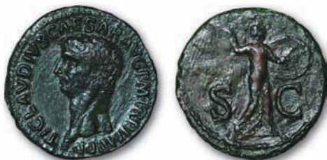
289 Roman Empire - Claudius - Minerva - AE - As. 11.33 grams. Rome. 50-54 AD. Obv: TI CLAUDIVS CAESAR AVG PM TR P IMP P P; bare head left. Rev: S C; Minerva standing right, brandishing spear; shield on left arm. RIC 116; BMC 206-207, RCV 1862. Very fine, better than photographed. £80 - £120