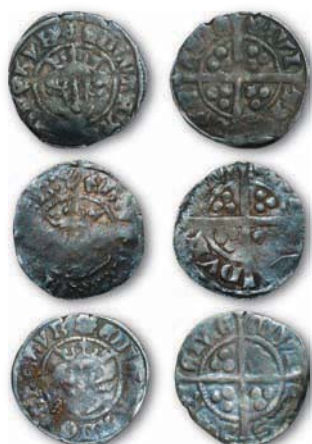
347 Tutbury 1831 Hoard - Edward II - Durham Royal and Bec Pennies (3). 1.42, 1.42, 1.35 grams. 1307-1327 AD. Classes 11a (2) and 15 (with i.m. lis with lions). Durham mint. Fine and better; darkly patinated, as discovered; with the original inscribed 19th century paper wraps (numbered 9 and 10). Ex Doggett family; ex Lord Holland; ex Tutbury 1831 Hoard (River Dove). Exhibited at the British Museum, 2009. £300 - £500