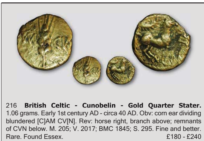
216 British Celtic - Cunobelin - Gold Quarter Stater. 1.06 grams. Early 1st century AD - circa 40 AD. Obv: corn ear dividing blundered [C]AM CV[N]. Rev: horse right, branch above; remnants of CVN below. M. 205; V. 2017; BMC 1845; S. 295. Fine and better. Rare. Found Essex. £180 - £240