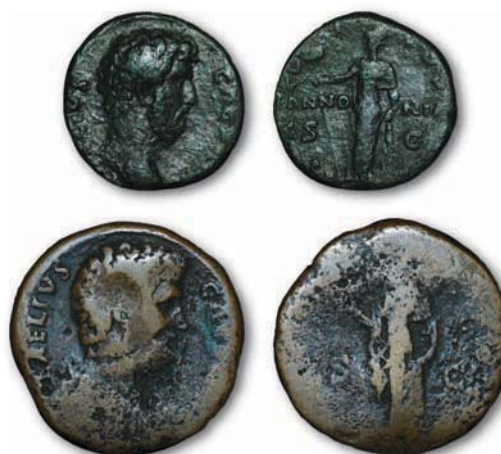
297 Roman Empire - Aelius - AE Sestertius and As (2). 10.36, 26.92 grams. AE As. Obv: L AELIVS CAESAR, draped bust right. Rev: TR POT COS II S-C, Spes standing left, holding flower and raising hem of robe. 137 AD. AE Sestertius. Rome. Obv: L AELIVS CAESAR, bare head of Aelius right. Rev: TR POT COS II, PANNO-NIA S-C, Pannonia standing facing, head left, holding vexillum upright on ground in right hand and raising hem of robe. Cohen 57; RIC 1067b; Sear 3993 and RIC 1059; BMC 1919; Cohen 24; Sear 3981; see also wildwinds (this coin). Fair to fine; both scarce. £40 - £60