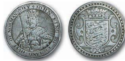
473 Van der Passe - King John - Silver Card Counter. 2.87 grams. Circa 1630-1635 AD. From the Sovereigns of England Series; school of Van der Passe. Obv: half length figure of John. Rev: Royal arms. Mitchiner 4854. Very fine; scarce. £120 - £200