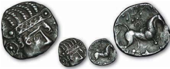
229 British Celtic - Iceni - Bury Type B - Silver Unit. 1.29 grams. Circa 50-40 BC. Obv: Celticized female head right with corded hair, wearing a diadem. Rev: horse right. Allen type: Bury B; BMC 3524-35; S. 432 var. About extremely fine. Celtic Coin Index Registration number: CCI 98.2295. £200 - £300

Probably pellet-and-ring design above horse.