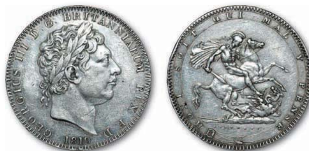
70 George III - 1819 (LIX) - Crown. 28.21 grams. Dated 1819. New Coinage. Obv: profile bust with date below and GEORGIUS III D G BRITANNIARUM REX F D legend. Rev: St George and dragon in garter. S. 3787; ESC 215. Near extremely fine. £200 - £300