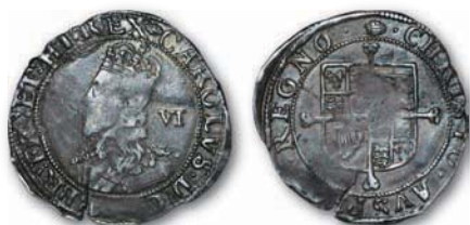
437 Charles I - Tun - Tower Sixpence. 2.76 grams. 1636-1638 AD. Group E. Tun mintmark. Obv: profile bust with small VI behind. Rev: cross moline over arms. S. 2814; N. 2242. Good fine, small striking split to edge. £70 - £90