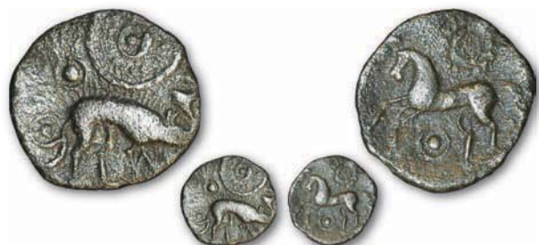
220 British Celtic - Corieltauvi - Boar and Horse - Silver Unit. 1.10 grams. Circa 55-45 BC. Hostidius Type, Corieltauvian B. Obv: boar right, elaborate anemone above, tail has anti-clockwise curl, 'S' object below, elaborate spiral above head. Rev: Celticized horse left with large ring of pellets above. V. 855-3; S. 396. Very fine with a dark ancient tone. Found Lincolnshire by eye in the 1920's. £60 - £90