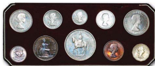
171 Elizabeth II - 1953 - Cased Coronation Proof Set (10). Dated 1953. Comprising ten coins: crown, halfcrown, florin, shillings(2), sixpence, threepence, penny, halfpenny and farthing. S. PS19. About FDC, few tiny hairlines, lightly toned, in case. £70 - £90

WE ARE NOW ACCEPTING SINGLE COINS AND COLLECTIONS FOR OUR FORTHCOMING SALES.