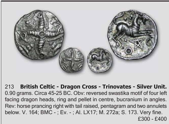
213 British Celtic - Dragon Cross - Trinovates - Silver Unit. 0.90 grams. Circa 45-25 BC. Obv: reversed swastika motif of four left facing dragon heads, ring and pellet in centre, bucranium in angles. Rev: horse prancing right with tail raised, pentagram and two annulets below. V. 164; BMC -; Ev. -; Al. LX17; M. 272a; S. 173. Very fine. £300 - £400