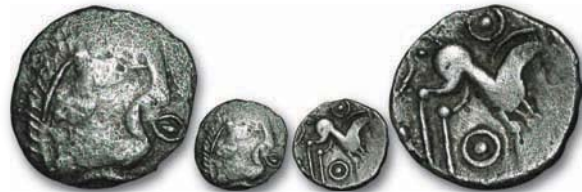
235 British Celtic - Iceni - Early Face/Horse Type - Silver Unit. 1.09 grams. Circa 50-30 BC. Obv: Celticized male head right with herringbone hair and large eye. Rev: Snettisham type horse right, wheel above. V. 665.07; Allen type: EFH CA; BMC 3356-3555; S. 433 var. Fine/very fine. Celtic Coin Index Registration number: CCI 01.1624. Found Suffolk 2001. £100 - £150