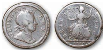
40 George I - 1717 - Dump Farthing. 4.46 grams. Dated 1717. First 'Dump' Issue, dies ↑↓. Obv: with GEORGIVS. REX legend. Rev: Britannia seated with date 1717 in exergue and BRITANNIA. legend. S. 3661; Peck 783(VS). Fine, rare and toned. £100 - £150