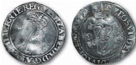
469 Ireland - Elizabeth I - 1561 - Shilling. 3.99 grams. Dated 1561 AD. Fine Coinage. Obv: profile bust with harp mintmark. Rev: crowned harp dividing date. S. 6505. Fine and better for issue. £100 - £150