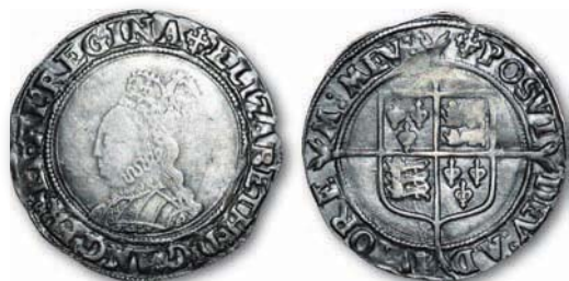
407 Elizabeth I - Cross Crosslet - Second Issue Shilling. 6.35 grams. 1560-1561 AD. Second Issue, Bust 3c. Cross crosslet mintmark. Obv: Profile bust. Rev: long cross over arms. S. 2555; N. 1985 Good fine; reverse better; full flan. £170 - £220