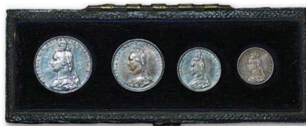
138 Victoria - 1888 - Cased Maundy Set (4). 1.88, 1.41, 0.94, 0.47 grams. Dated 1888. Jubilee head, dies ↑↓. Obv: with VICTORIA DEI GRA BRITT. REGINA FID:DEF: IND. IMP. legend. Rev: crown over 4 (3, 2, or 1) legend in two lines within wreath and with date below. Uncirculated, deep tone. In original dated case of issue. £100 - £150