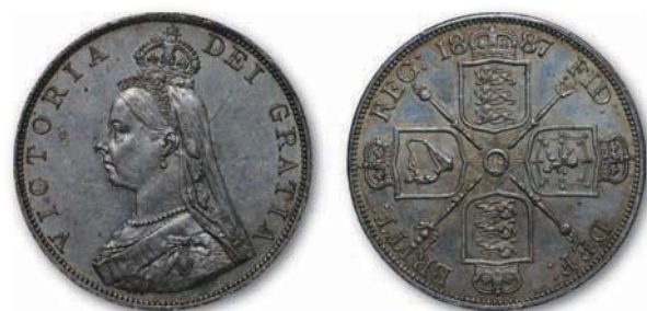
130 Victoria - 1887 (Roman) - Double Florin. 22.64 grams. Dated 1887. Jubilee head, dies ↑↓. Obv: with VICTORIA DEI GRATIA legend. Rev: crowned cruciform shields with sceptres in angles and date (Roman I) at English arms with BRITT: REG: FID: DEF: legend. S. 3922; ESC 394. Uncirculated, full matt tone with underlying lustre; few tiny contact marks. £90 - £120