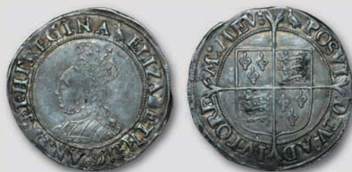
406 Elizabeth I - Martlet - Second Issue Shilling. 6.10 grams. 1560-1561 AD. Second Issue. Martlet mintmark. Obv: profile bust. Rev: long cross over arms. S. 2555; N. 1985. Very fine and better. £350 - £500