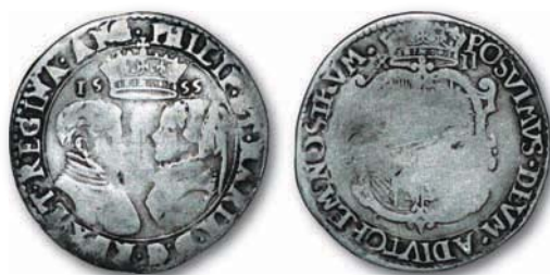
404 Philip and Mary - 1555 - Shilling. 5.70 grams. Dated 1555 AD. English titles. No mintmark. Obv: crown over profile busts facing. Rev: crown over shield of arms. S. 2501; N. 1968. Fine; busts and date clear; scarce. £300 - £500