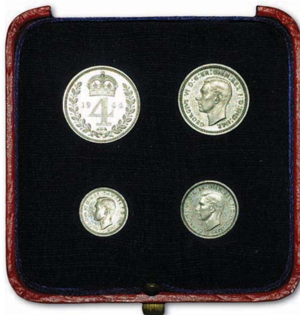
170 George VI - 1944 - Cased Maundy Set (4). 1.88, 1.40, 0.94, 0.47 grams. Dated 1944. Dies ↑ ↓. Obv: with GEORGIUS VI D:G:BRITT:OMN:REX F:D:IND:IMP: legend. Rev: crown over numeral 4 (or 3, 2, 1) dividing date 19-44 within wreath. S. 4086; ESC 2563. Uncirculated, matching light iridescent tone and cased. £70 - £90