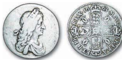
478 Charles II - Political Token - 1663 Shilling. 5.68 grams. Dated 1663 AD. First Bust. The obverse with legend removed. Reverse normal. S. 3371. Very fine; rare and interesting. £60 - £90

While private countermarks may be quite often seen on coins, it is most unusual for these to be applied to coins of both the hammered and milled series. A most interesting group.