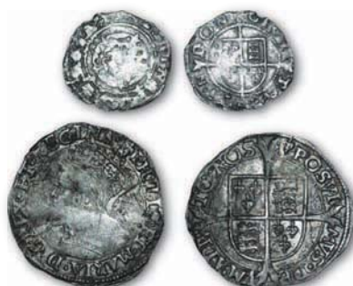
405 Philip and Mary - Groat and Base Penny (2). 1.76, 0.64 grams. 1554-1558 AD. Groat. Obv: profile bust with lis mintmark. Rev: long cross over arms. Base penny. Obv: rose with castle mintmark. Rev: as groat. S. 2508/2510A; N. 1973/1976. Fine and good fine for issue. £100 - £150