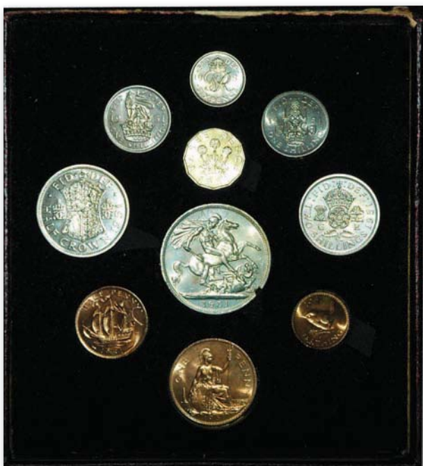
169 George VI - 1951 - Cased Festival of Britain Proof Set (10). Dated 1951. Comprising ten coins: crown, halfcrown, florin, shillings(2), sixpence, threepence, penny, halfpenny and farthing. S. PS18. About FDC, few tiny hairlines, lightly toned, in poor original card case. £100 - £150