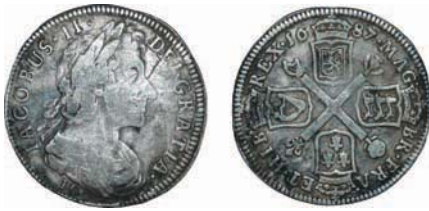
467 Scotland - James VII - 1687 - 10 Shillings. 4.38 grams. Dated 1687 AD. James II of England. Obv: profile bust with 10 below. Rev: St. Andrew's cross and emblems with date. S. 5641. Fine and better. £70 - £90