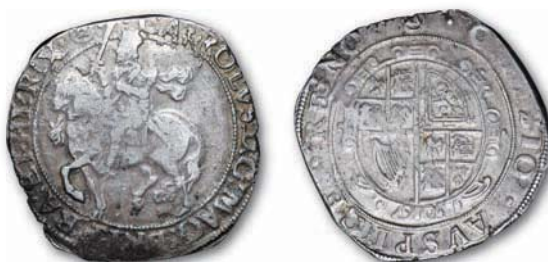
440 Charles I - Group IV - Triangle-in-Circle - Tower Halfcrown. 14.26 grams. 1641-1643; Group IV; Type 4. Triangle-in-circle mintmark. S. 2779; N. 2214. Good fine, reverse better. £70 - £90